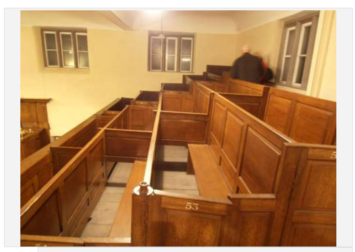
box pews on balcony