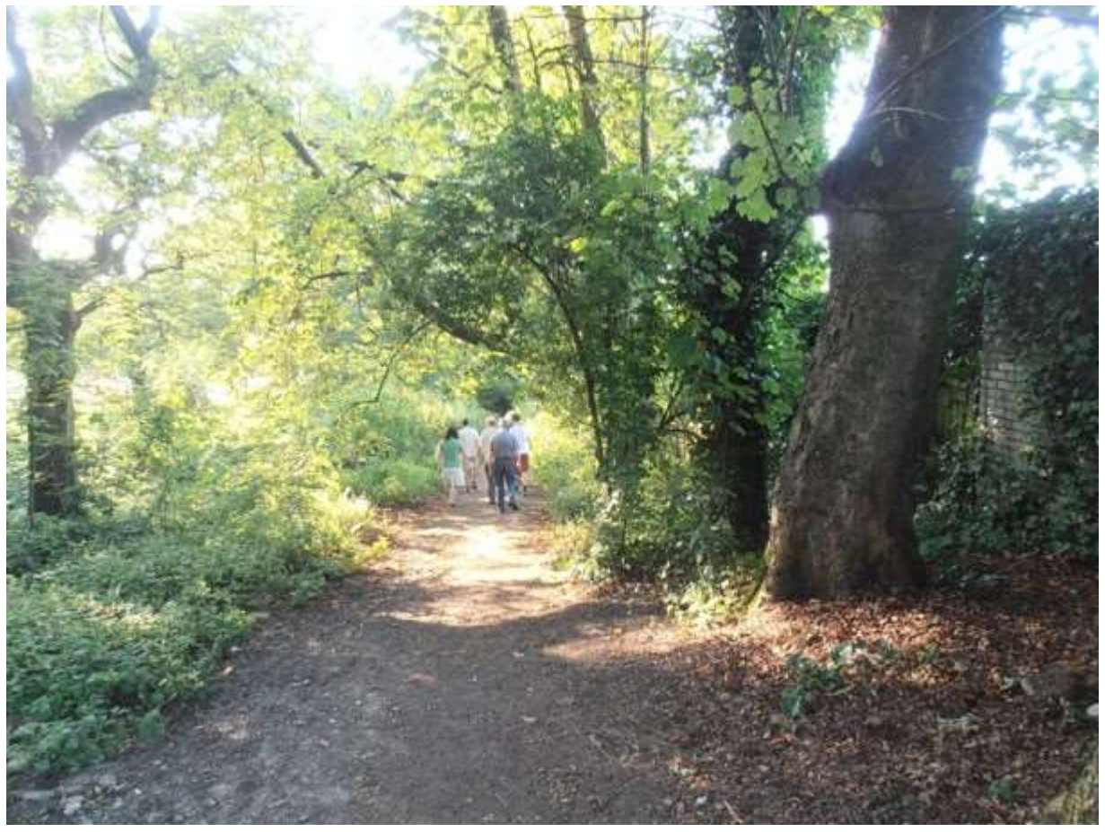
towards the site of the P.O.W. camp

to the bottom Whiteheads Lodge, where we discussed the P.O.W Camp. Then we headed back via Whitehead's Middle Lodge, the Weavers Cottages and Knowsley Road.