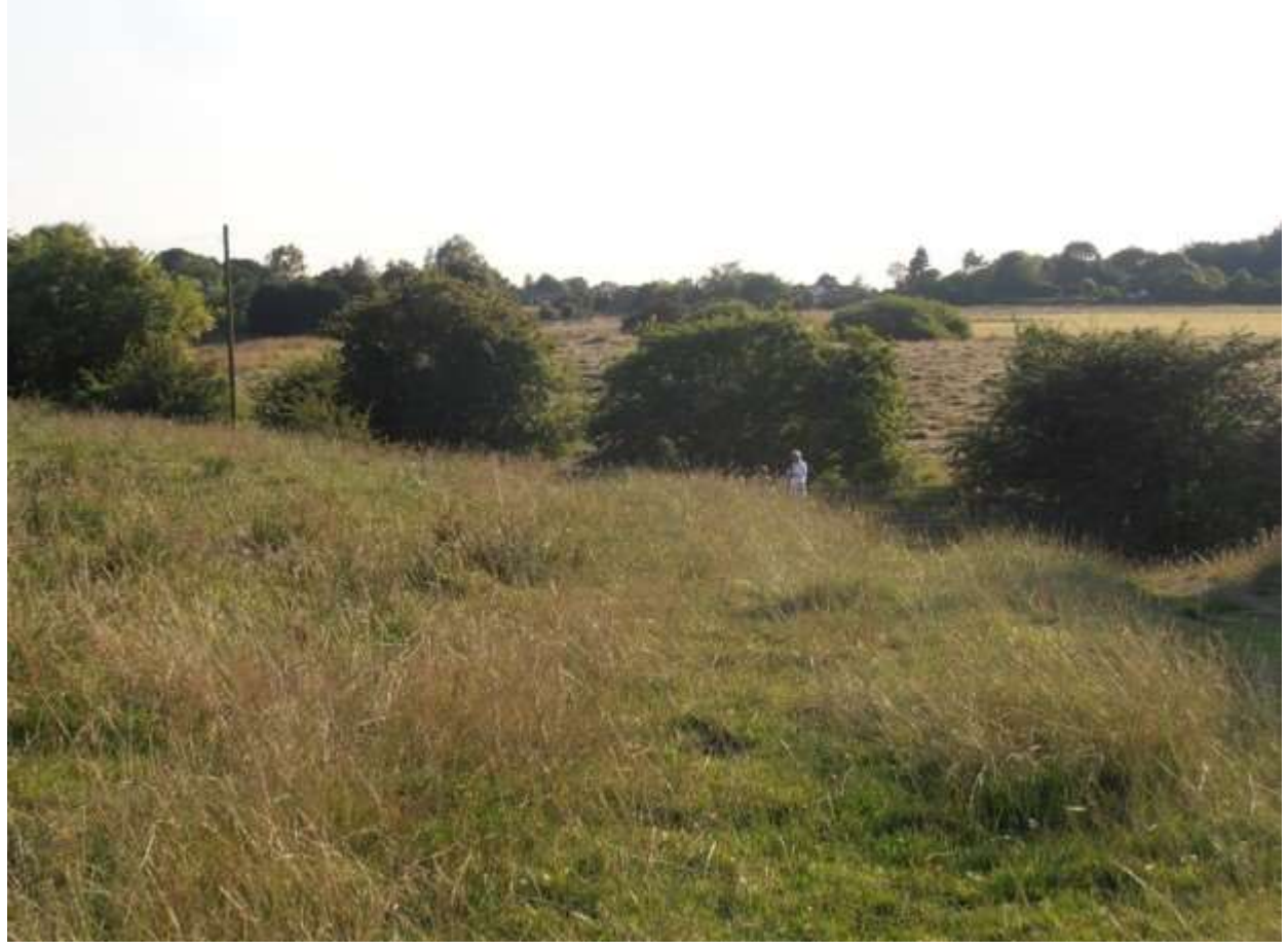
The Quarry Railway route