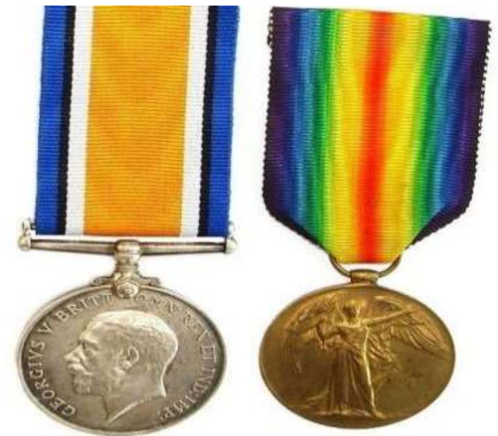
British War & Victory Medals